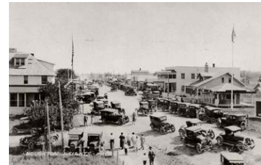
Haunted Heights Paracon 2018 MAY 18-20