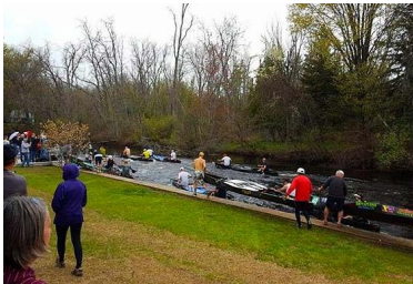
36th Annual Roscommon Canoe Challenge MAY 12-13