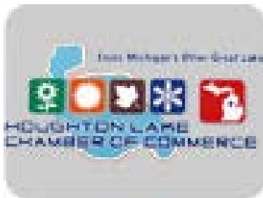
Houghton Lake Chamber of Commerce

For more information reach out to Roscommon Co. Chambers of Commerce