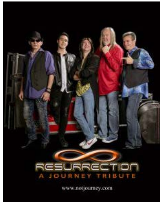
KIRTLAND CENTER PERFORMING ARTS MAY 12